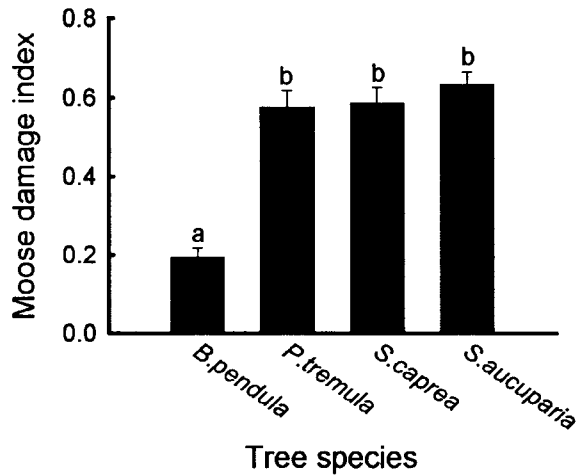
Fig. 1. Browsing intensity by moose on different deciduous trees expressed as the "moose damage index". The damage index was based on the proportion of browsed shoots of the total number of available previous year's shoots per tree. Error bars denote one standard error. A post-hoc test (Tukey's b multiple comparison test, p < 0.05 ) was used to determine which damage indices were different between tree species and are indicated in the figure by a small 'a' or 'b'.

Moose browsing had marked effects on tree architecture. Unbrowsed B. pendula and P. tremula were taller than browsed trees of the same diameter (Fig. 3a-d). Unbrowsed B. pendula and P. tremula trees were also taller than browsed trees of the same age (Fig. 3e-h).