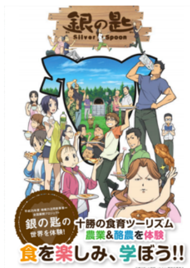
Figure 5: Cover page for Silver Spoon stamp rally, Obihiro Tourism and Convention Center.

character. Informational sections on milking experience, cheese production, modern farming, meat making, and the pleasure of cooking your own pizza feature iconic color images from the manga that signal key scenes related to these topics.