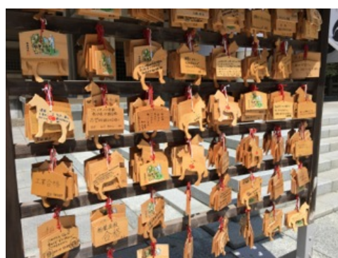
Figure 4: Votive tablets modeled on banba at Obihiro Shrine. August 2015.