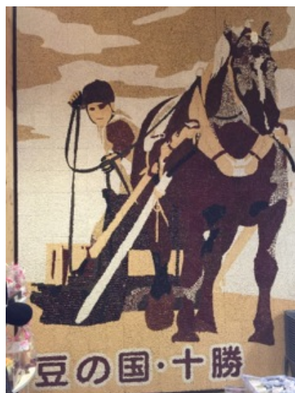
Figure 3: Portrait of a banba made of locally grown beans. August 2015.