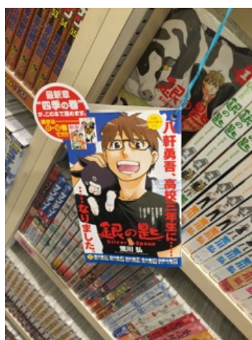
Figure 1: Bookstore display of Silver Spoon manga. August 2015.

Silver Spoon quickly drew the attention of fans and critics alike in 2011 and has sustained its popularity in the years since. It swiftly became the publisher Shogakukan's top seller and by October of 2013 had sold twelve million copies in Japan. In 2012, the series won the coveted Grand Prize of the annual Manga Taishō Award and the Shogakukan Manga Award in the youth category. Another early trend that signaled Silver Spoon 's reputation was the 110 per cent increase in applicants to the Dairy Sciences Course at Obihiro Agricultural High School the year after the manga debuted. 2 More recently, it numbered among the nine nominees for 2015 Tezuka Osamu Cultural Prize. Responding to Silver Spoon 's wide and growing following, a two-season anime series was aired between July 2013 and March 2014, and the “high-profile” show was picked up by NoitaminA, an alternative-audience, late-night programming block reserved for anime (Fuji TV). 3 Additionally, a live-action film (dir: Yoshida Keisuke) premiered in Tokyo in March 2014, with the catch phrase “A Most Outrageous Story of Youth!” Teen idol Nakajima Kento, who played the main character, rallied his adoring fans to the flic, which was viewed by over 89,000 people in just the first two days.