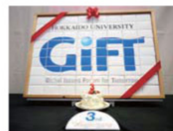
Marking the 3rd anniversary of GiFT

► http://www.sustain.hokudai.ac.jp/gift/