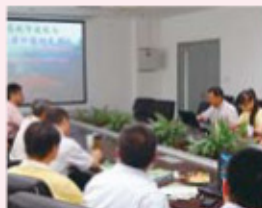
Symposium was held in China

This symposium on the future of sustainability science was held at China's Zhejiang University (an HU partner institution), and was attended by university representatives from China, Indonesia, Taiwan and Japan. Sustainability science is a new academic discipline intended to support the creation of sustainable societies. Attendees discussed ways to advance sustainability science in a manner that will help to address sustainability issues in each country.