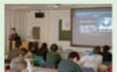
The lecture of part-1

Students organized this symposium to provide a platform for discussions on the influences of alien species in order to help maintain Hokkaido's rich natural environment. The event featured experts on mammals, plants, insects, amphibians, reptiles, fish and crustaceans. The attendees learned about current situations in the field and discussed countermeasures involving policy, technology and education.