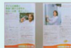
An example of the posters

Widespread sharing of the latest research outcomes is important for the realization of a sustainable society. Via the medium of posters, this exhibition highlighted the significance and usage of the Hokkaido University Collection of Scholarly and Academic Papers (HUSCAP; a free resource in which academic papers detailing the outcomes of research conducted by HU researchers and students are published as part of the university's international contribution).