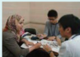
A discussion in the workshop

This symposium was organized in collaboration with HU and Kyoto University students who had previously attended the World Student Environment Summit (WSES). A total of 20 students from different countries, universities and areas of specialization considered food problems – the theme of the event – and discussed what can be done today to avoid passing such issues onto future generations.