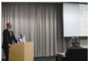
A speech was made by the President of the University of Oulu