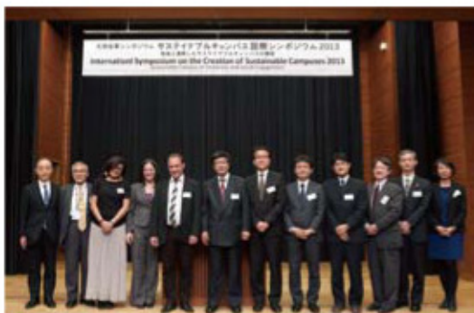
Photo of speakers

This event's theme was Sustainable Campus Creation in Collaboration with Local Communities. By showcasing pioneering examples of sustainable campus development and related plans in Tokyo, London, Turin and Amsterdam, the session provided ideas for work to build on the regional cooperation agreement concluded between HU and the City of Sapporo and for the formulation of more-concrete campus plans.