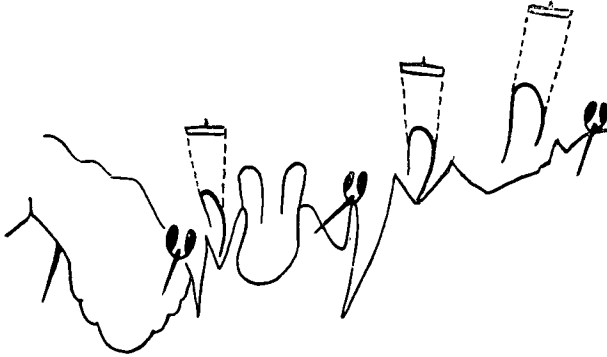
Fig. 2. Pseudaulacaspis bififormis sp. nov. Pygidial margin with triangular median lobe.

fourth; each duct or pair of ducts with a pore prominence. First pore prominence small, pointed apically; the second trilobed, median lobule being largest, the inner triangular, the outer smallest, triangular or bicuspid or sometimes obsolete; third and fourth pore prominences trilobed, inner lobule being largest, the median and the outer small, triangular or irregularly dentate. Marginal gland spines arranged as follows: 1 laterad of median lobe, 1 of the second, 2-4 of second pore prominence, 3-5 of the third, and 5-7 of the fourth.