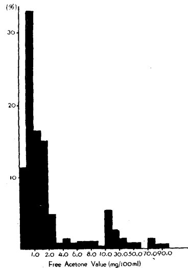
CHART 2. The Distribution of the Values for Free Acetone in Urin

as 0.10 mg/100 ml in the under limit and as 24.95 mg/100 ml in the upper limit. The mean value of the 199 cases (normal group) between the two limits was 1.25 (0.18~24.95) mg/100 ml and the mean value of the 16 cases over the upper limit (sub-normal group) was 54.50 (25.83~123.00) mg/100 ml; their appearance rate was 7.5%.