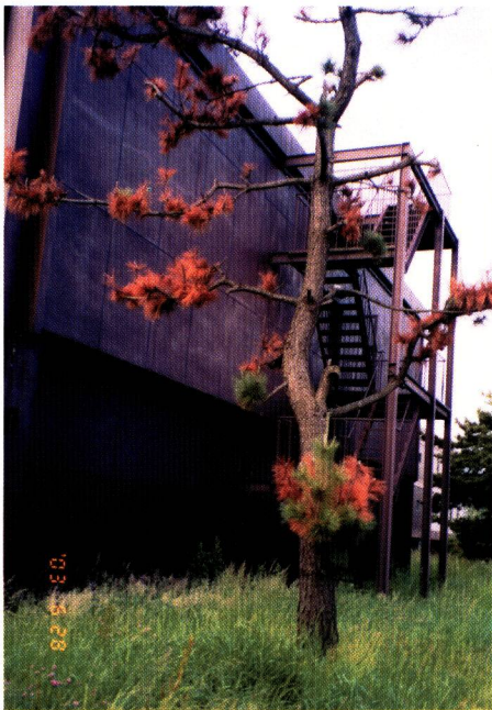
Fig. 4. A pine tree with total discoloration at Faculty of Fisheries of the Hokkaido University.