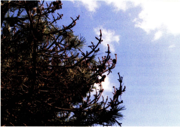
Fig. 2. A pine tree of dieback shoots at the Hakodate water purification plant.