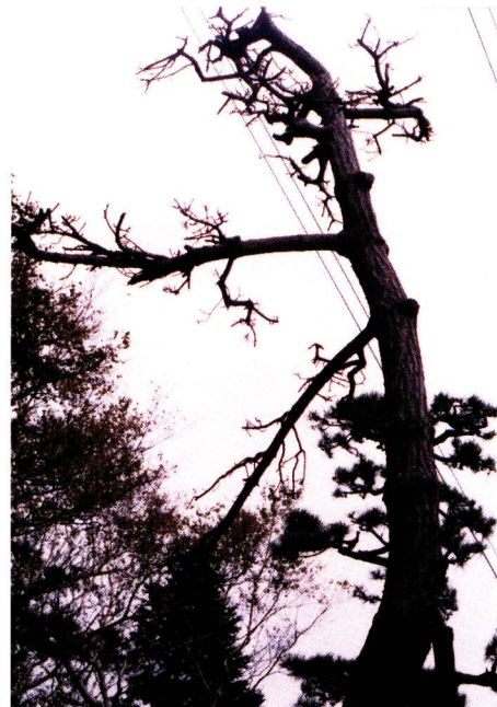
Fig. 5. A dead pine tree whose branches had been cut for several years at the Hakodate water purification plant.