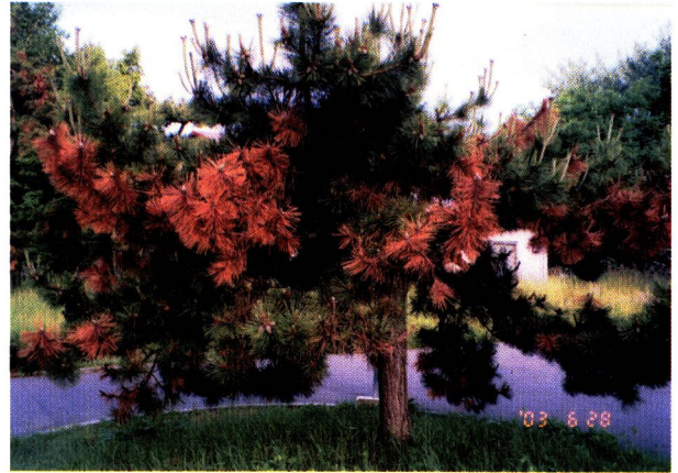
Fig. 3. A pine tree showing branch discoloration at Faculty of Fisheries of the Hokkaido University.