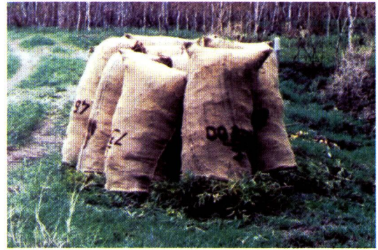
Harvested leaf-twigs of kayu putih