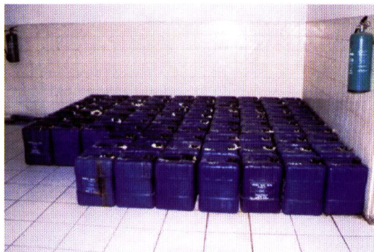
Kayu putih oil product