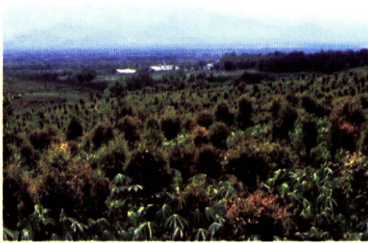
A kayu putih plantation with tumpangsari system (in East Java)