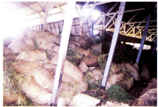
Leaf-twigs before extraction