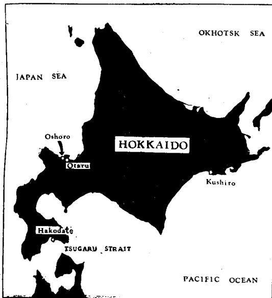
Fig 1. Sketch map of Hokkaido showing the situation of Oshoro Bay.

February: The community is the same as the preceding month, but the number of Pseudocalanus minutus greatly increases. The females of this species usually bear eggs.