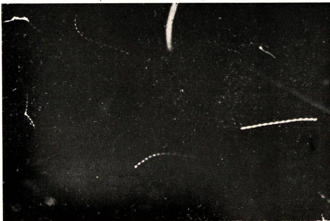
Fig. 6. Locus of the swimming motion of copepods photographed at 50 m depth