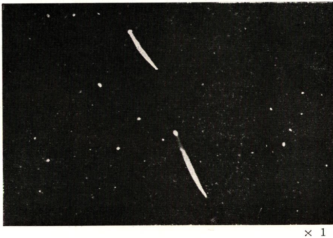
Fig. 3. Swimming animal plankton ( Sagitta and copepods) and suspended particles photographed at 40 m depth