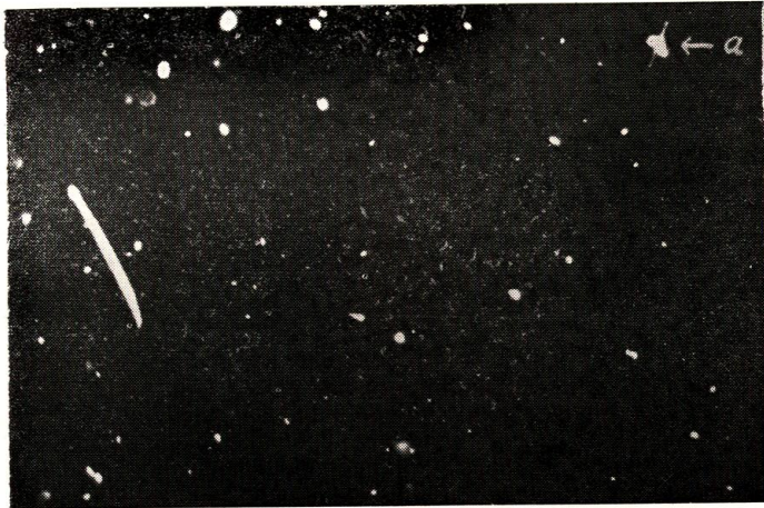
Fig. 4. Swimming animal plankton ( Sagitta and copepods) and suspended particles photographed at 50 m depth