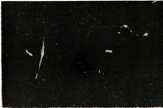
Fig. 5. Sagitta and suspended particles. A train of particles forming something like a string of beads is clearly shown. Photographed at 50 m depth.