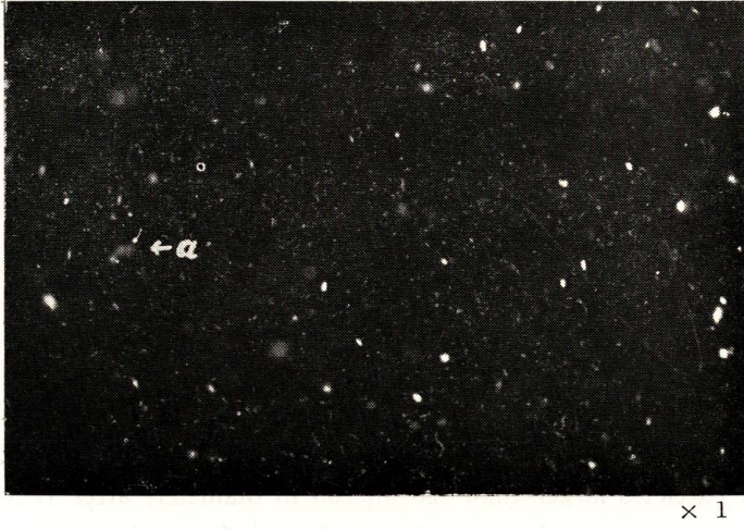
Fig. 1. Typical suspended particles found in the middle layer of coastal water, photographed at 50 m depth where the sea depth is 75 m