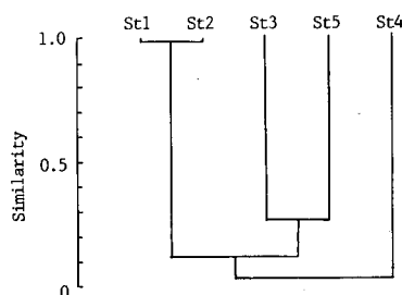
Fig. 3. Plot of result of the cluster analysis as a dendrogram.