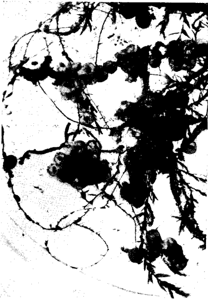
Fig. 5. Eggs of Hyla deposited on the aquatic plants. Seen from above. (About natural size)

observed depositing the eggs at the dawn of June 6, and another female which was mated on July 30 spawned in the morning of July 31. At first the eggs extrude and then the discharge of the seminal fluid follows. Thus fertilization is carried out in the water. However, the deposition of the eggs does not take place simultaneously as in Rana but lasts at least 2 or 3 hours since the animal spawns only 5-30 eggs in succession. After one spawn it removes soon to another place to make another deposition. Accordingly the eggs so deposited are scattered in the water, sometimes directly on the bottom, sometimes on the grasses or on the fallen twigs instead of in clumps (Fig. 5).