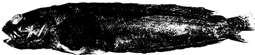
Fig. 1. Bathymaster caeruleofasciatus GILBERT & BURKE

Body compressed, elongated, anterior profile convex from tip of snout to dorsal. Mouth gently oblique, the maxillary reaching to posterior margin of pupil. Snout shorter than eye, gently sharp. Lower jaw slightly included, symphysis of mandible with broad band of small conical teeth bordered in front and behind by series of strong canine like teeth, band rapidly narrowing laterally, the anterior series disappearing and posterior series of enlarged teeth continued laterally. Large conical teeth band in palatine and a single in vomer. Branchiostegal membranes scarcely connected. Margin of preopercle furnished with 5 conspicuous mucous pores,