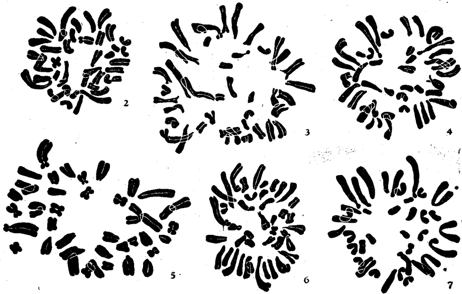
Figs. 2 to 7. Camera-lucida drawings, ca. 2200 \times . Figs. 2-6. Metaphase plates of monocytes having 42 chromosomes. (2-3, from the normal peritoneal fluid, 4-6, from the treated peritoneal fluid). Fig. 7. A metaphase plate of 3V-type cell of the Hirosaki sarcoma, having 38 chromosomes. Prominent three V's are indicated with asterisks.

Recently Makino and Hsu (1953), working with tissue culture material, have shown that in the somatic complement of the Norway rat eight autosomal pairs and the X-element are characterized by metacentric structure having two dissimilar arms. According to them, the chromosomes in the descendent order, namely those numbered 1, 4, 8, 11, 12, 15, 16 and 19, are composed of the V- or J-shaped elements. In the present material it was in practice difficult to determine