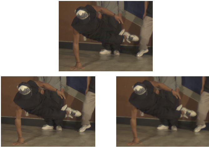
Fig. 3. Example of original image(top), before filtering(bottom-left), and after filtering(bottom-right)

quality, so it may be necessary to encode prediction residuals if the target quality is raised.