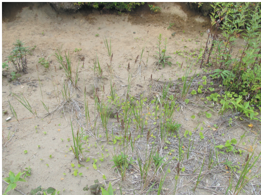
Figure 4. Rubus phoenicolasius , Artemisia montana , and Maianthemum dilatatum growing together with C. neglecta on sandy ground.