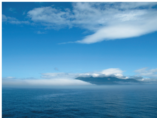
Figure 7. Kunashir Island covered by sea fog.