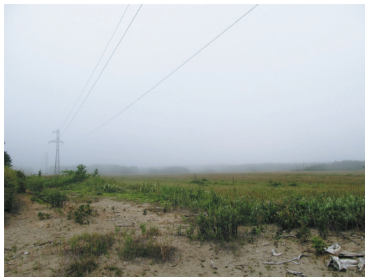
Figure 3. Power-transmission line in Serebryanoye Mire (Furukamappu Mire).