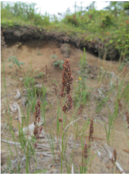
Figure 2. Calamagrostis neglecta growing on sandy ground.