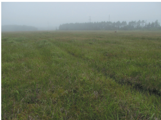
Figure 6. Serebryanoye Mire (Furukamappu Mire) covered by fog.