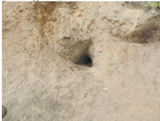
Figure 5. Den of a small mammal on bare sandy ground.