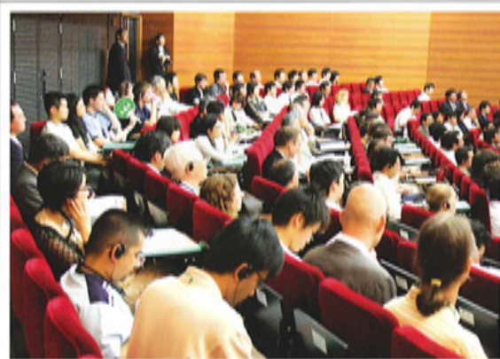
The venue was full of audience