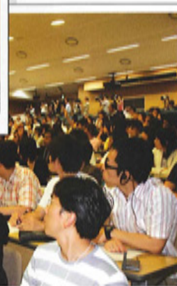
Students enthusiastically pose questions