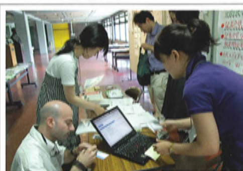
Registration of Citizens Media Center

Hokkaido University provided space during the summit to the G8 Hokkaido Toyako Citizens Media Center Sapporo for independent media providers creating content from unique perspectives. Citizens' media gathered from all over Japan and the world to report the news.