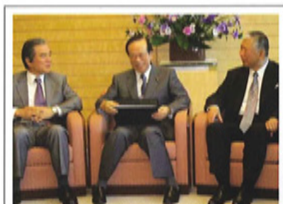
Delivery of the SSD to Prime Minister Fukuda

This declaration was later delivered to Prime Minister Fukuda.