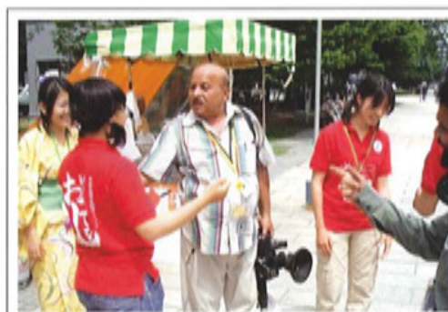
Team Sapporo Omotenashi