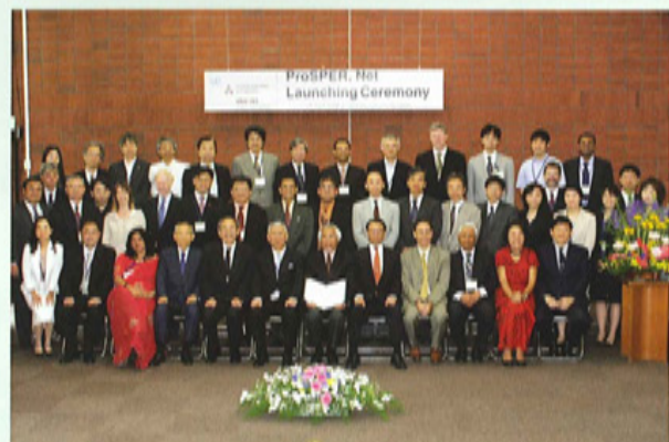
ProSPER.Net Launching Ceremony

Hokkaido University is participating as both a member and trustee, and is working with the United Nations University Institute of Advanced Studies, which assumes the secretariat of ProSPER.Net, and other member universities to promote research and graduate education.