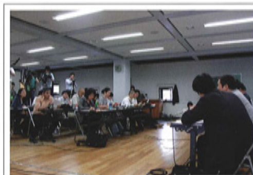
The Venue of press conference