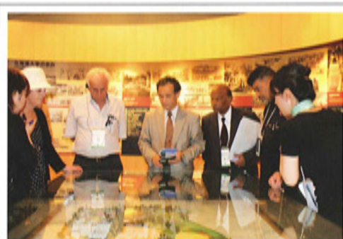
Visitors from all over the world