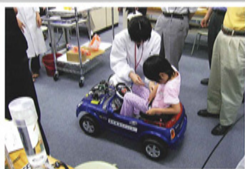
Children get in a fuel cell car at a citizens' lecture