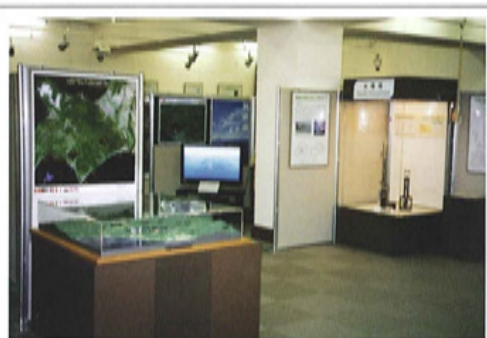
Exhibit "Environment and Resources of Lake Toya and Usu Volcano Area"

Sustainability Weeks 2008 included two special exhibitions "Knowledge of University for All the People" and "Environment & Resources of Lake Toya & Usu Volcano Area". These were attended by more than 20,000 local and international visitors of all ages.