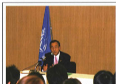
Keynote speech from UN Secretary-General Ban Ki-Moon

In the discussion following his talk, the Secretary-General consideredly answered the questions asked enthusiastically by students.