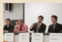
Representatives answering questions

educational programs and student activities for sustainable development, which attracted 46 students interested in study overseas and faculty members supporting those students.