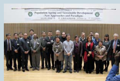
Presenters and organizers after a well-received forum successful forum

Aiming to search new approaches and paradigms for realizing a healthy aging society, grad schools of Hokkaido University hosted an intensive seminar for students of HU and Politecnico di Torino in Italy. It was followed by a public forum that attracted 308 people as well as experts from medicine, demographics, sociology and welfare engineering. Researchers from Italy, South Korea, Switzerland, Sri Lanka, Thailand and Japan reported on the current status and future prospects concerning the aging societies of their respective nations.