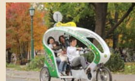
A Velotaxi decorated with autumn colored fallen-leaf stickers

With the cooperation of Hokkaido Green Purchasing Network, Velotaxis, eco-friendly cycle rickshaws, were operated on the Sapporo Campus by grad students of Environmental Science. A total of 918 tourists and locals took Velotaxi rides during the two-week period and enjoyed having a casual chat with the driver concerning the true meaning of Sustainability Weeks. Passengers were able to leave messages on leaf-shaped stickers which were then placed on the rickshaws expressing their own green efforts.