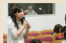
A medical student asking programs in detail

Hokkaido University has kept inviting overseas partner institutions that actively engage in realization of a sustainable society since 2008. This year, HU invited representatives from Beijing Normal University (China), De LA Salle University (the Philippines), Korea University (South Korea), Mahidol University (Thailand) and Swiss Federal Institute of Technology. They outlined their excellent