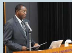
H.E. Minister L. Sedogo

With the attendance of H.E. Dr. Laurent Sedogo, Minister of Agriculture, Water and Fisheries, Burkina Faso, the symposium attracted 120 people including researchers, grad students and JICA officials. Focusing on elimination of waterborne diseases, it held research presentations on urine and its use; water treatment; policies and social aspects; and composting feces and its use. Based on the outcomes of this symposium, pilot experiments are scheduled for implementation in Burkina Faso.