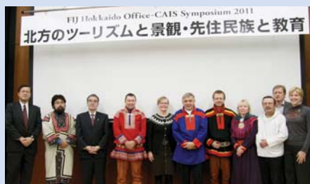
Speakers and staff of The Finnish Institute in Japan Hokkaido Office and the Center for Ainu and Indigenous Studies

This symposium concerned research on the indigenous knowledge transmission in Hokkaido, Finland and Norway. Speakers from the three countries reported on challenges of education and the role of the media, especially FM radio broadcast, to preserve indigenous languages. Some activities such as a student exchange program and a language seminar were discussed for future possible collaboration.