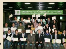
Award ceremony with award nominees and winner

members and students examined posters and presentations as judges. Six outstanding presenters received the HU Sustainability Research Poster Award.