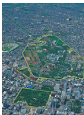
Hokkaido University Sapporo Campus (outlined in yellow)

Archives: http://www.sustain.hokudai.ac.jp/GIFT/archive.php