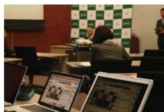
Live broadcast on the internet