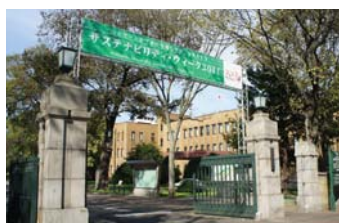
Banner located at the main gate