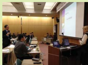
Q & A session with simultaneous interpretation in JPN, CHN and RUS

With the aim of environmental conservation and sustainable development, presenters from Japan, China, Russia and Mongolia shared academic data on the Amur River basin and the Sea of Okhotsk. This meeting was attended by 220 individuals from the general public, universities, research institutes and government organizations. A program of joint observation and navigation on the Amur River by the four countries is scheduled for 2012, and the third international meeting is scheduled for 2013 in Russia.