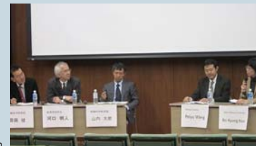
A very active panel discussion

With researchers from Peking University and Seoul National University-Hokkaido University's partner institutions, the symposium focused on health issues in Japan, China and South Korea considering lifestyle and social environment differences. Finding the common challenges such as diabetes, metabolic syndrome, low physical fitness and stress-related suicides, over seventy participants reaffirmed the continuous collaboration in research among the three countries.