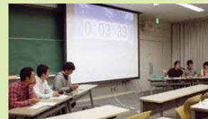
Enthusiastic presentation attracted the audience

To make Sapporo city sustainable, 15 teams of students presented their own transportation designs based on various modes of transportation, including bicycle, bus, taxi and even underground waterways and faced off against their competitors in an exciting debate. After eight hours, the first place went to a joint team of students from the Faculty of Engineering, the Graduate School of Veterinary Medicine and the School of Law. Unique ideas and many incoming questions made it an exciting event.