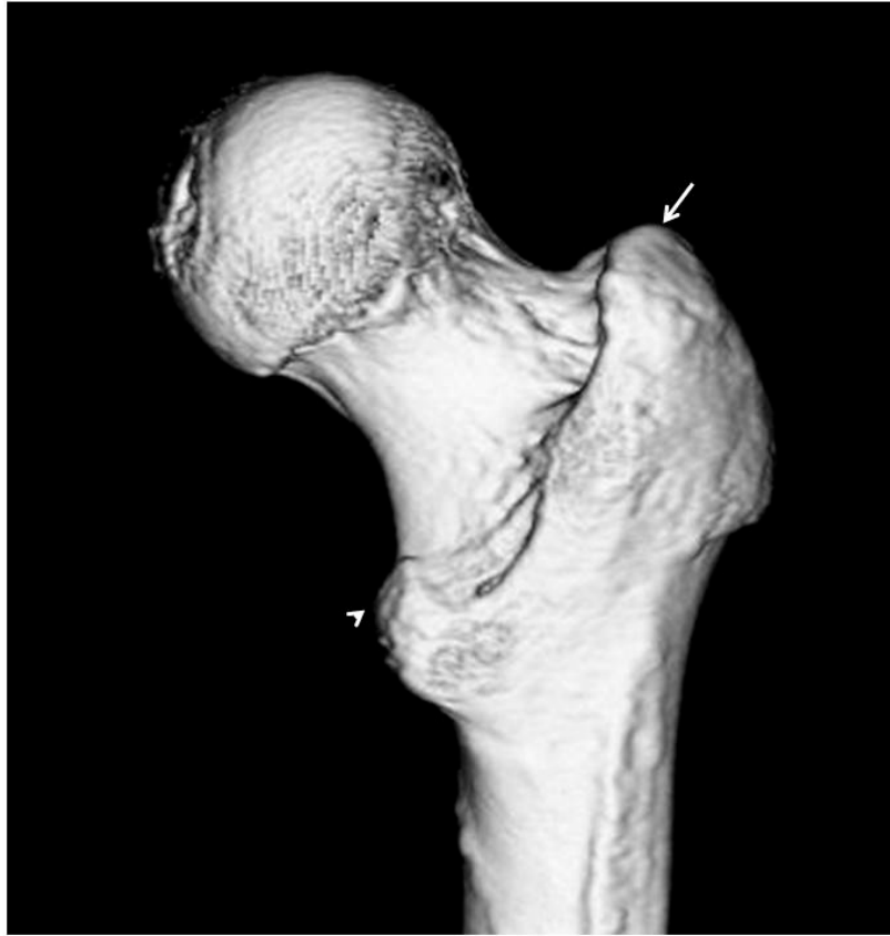
Fig 1a proximal femur