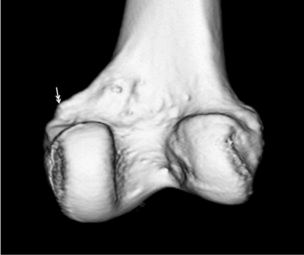
Fig 1b distal femur

Double arrow shows the adductor tubercle