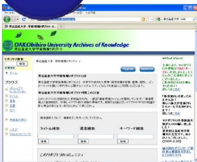
OAK front page http://ir.obihiro.ac.jp/

The wide range of support from the DRF is attractive for us. It not only keeps in line with the leading discussions of scholarly information in Japan, but answers the questions from the beginners who have just started to set up their repository. For the small and yet unskilled staff teams like the OAK team, it is a big mental support to have someone to rely on, and to have somewhere people help each other. We hope that the DRF will continue to be a reliable community for repository managers in Japan.