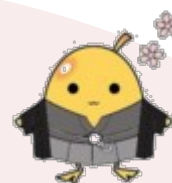
Ginmaru-kun with traditional "haori-hakama"