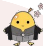
Ginmaru-kun with traditional "haori-hakama"