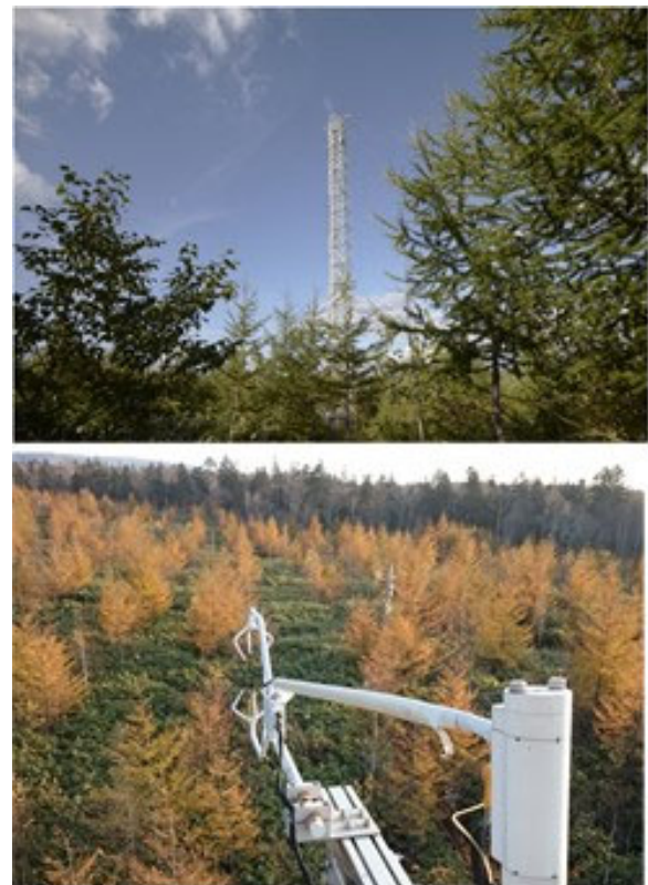
Figure 2. 30-m high CO 2 flux monitoring tower (upper) and sensors (lower)

This research was a collaboration among Hokkaido University, National Institute for Environmental Studies, and Hokkaido Electric Power Co., Inc. through the