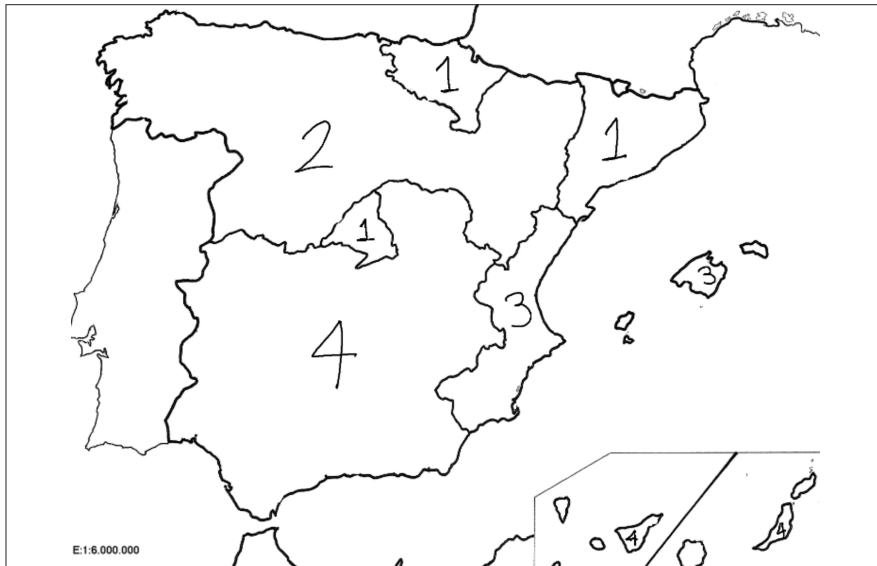
Map 1. Four different “rural Spain”