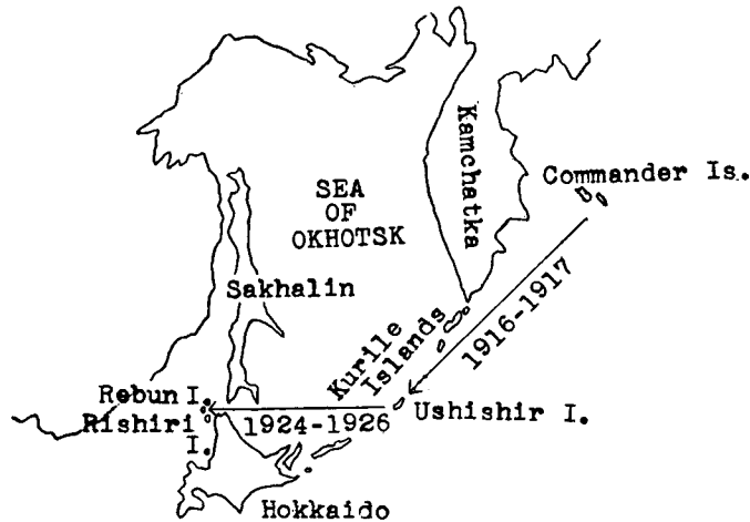
Fig. 2. Sketch map showing the route of transference of foxes.

It is highly probable that the infested blue foxes were transferred into the Middle Kuriles and the parasite became epidemic among the field mice which again transmitted it to the native red foxes. Fortunately, the Middle Kurile region was almost uninhabited except by a few inspectors and watchmen, being quite separated from the Japanese community. However, 2 human echinococcosis patients discovered in Japan were originated from the Middle Kuriles, having been there in their career.