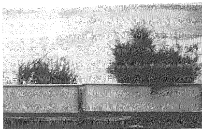
Fig. 1. Asparagus seedlings 120 days after inoculation of Glomus spp. Left : noninoculated seedlings. Right : inoculated (100 spores/g inoculum) seedling.

y Evaluated by Gridline Intersect Method: root segments 1 cm in length are uniformly and randomly excised from all roots of each seedling; criteria in a portion of the segment surface layer that is selected by the method are microscopically observed; percentages of root segments with a cystidium are calculated. Confidence limits (t•s.e. at P=0.05).