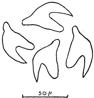
FIG. 1. Rostellar Hooks