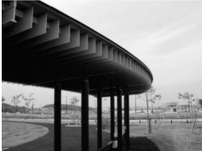
Figure 3. Kakikaki shapes observed on structure in public park

Designers are naturally interested in creating more sophisticated forms. There are many types of facilities required in public parks, and they are all subject to functional requirements of safety and hygiene. Even ‘Disneylandization’ fulfils a function in the Japanese social context, but budget limitations prevent the ‘Disneylandization’ of everything. Municipal officials often require inconspicuous facilities like benches and bowers to have more moderate forms than those of large central buildings and playgrounds, so designers can apply more sophistication and taste to them. Local officials are practical and can ignore factors that lead to pomposity in the form of central facilities. They may refer to the designers’ more sophisticated forms as asobi (amusement). The originality and creativity of such forms are recognized within the field of public design, but ordinary people seldom notice them 5 . In the author’s opinion, these design practices need to be given greater acceptance in the official design process. Simple geometric patterns are good examples of high style in such design practices, as seen in fig. 3. The beam brackets of the arbour are flat bars of finespun steel. The number of beams is greater than that needed for structural strength. Many arbours in Japanese parks are shaped like simple cubes. Cube-shaped arbours have been fashionable for many decades in Japanese landscape design.