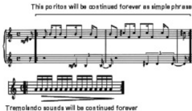
Figure 5. Designed sound phrase

This type of oto does not follow a chord progression, passing from introduction to cadence. Also, because they are set at such a low volume, they do not require a large audience. In an ordinary cultural context, such an array of sound would not be called ‘music.’