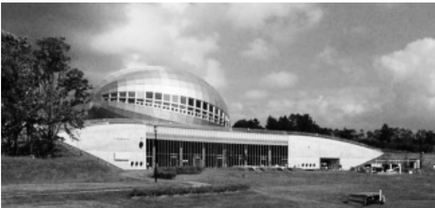
Figure 2. Example of ‘Disneylandization’ in a Japanese building

Japanese landscapists are concerned with making more beautiful green spaces. They see this as the best way to improve regional landscapes and make people’s lives better and happier. But what is a good landscape? An easily recognised objective criterion is necessary. In a word, it is ‘the greatest happiness for the greatest number.’ Design professionals working in cities also share this criterion.