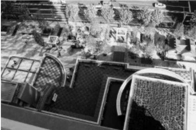
Figure 4. Tornale Nihonbashi Hamacho

Each person adds his or her input to the sound as ideas are developed through casual conversation in cordial atmosphere. Everyone expresses their own impressions of the sound and these statements lead to creation of new ideas. The ideas are carried out at immediately and modified according to the group's response. This process is continued.