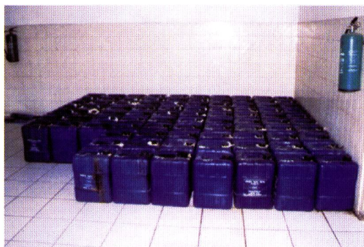
Kayu putih oil product