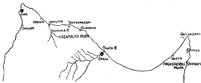
Fig. 2. Map of Shimokita District, Aomori Prefecture.

Since 1939, the yield of abalones has been diminishing and as a consequence causing a severe reduction of Laminaria . Only about 1% of the output of former times now is being produced for household use. In this district Sargassum Thunbergii is found at the highest degree of luxuriance of all algae. On the other hand, such useful algae as Nemacystus decipiens , Hijikia fusiforme , porphyra sp. , Gelidium Amansii , G. vagum , Rhodoglossum pulchrum ,