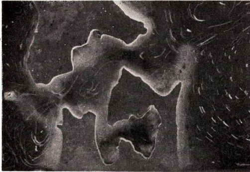
Fig. 2, (a). Exposure=6 sec, rather fast inverse current.