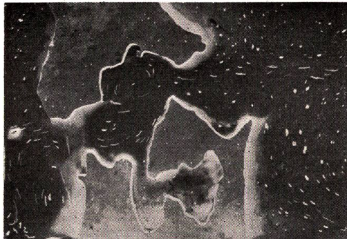
Fig. 2, (c). Exposure=6 sec, slow current.