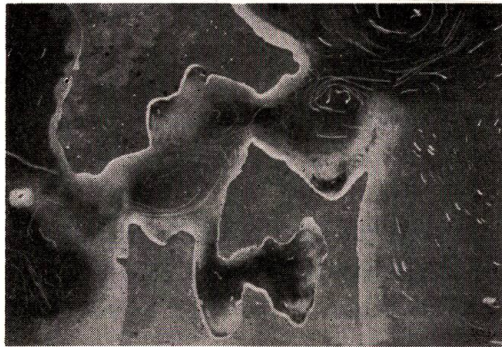
Fig. 2, (b). Exposure=6 sec, rather fast current.