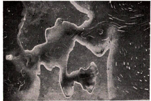
Fig. 2, (e). Exposure=6 sec, rather fast current.