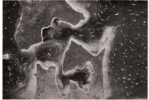
Fig. 2, (d). Exposure=2 sec, rather fast current.