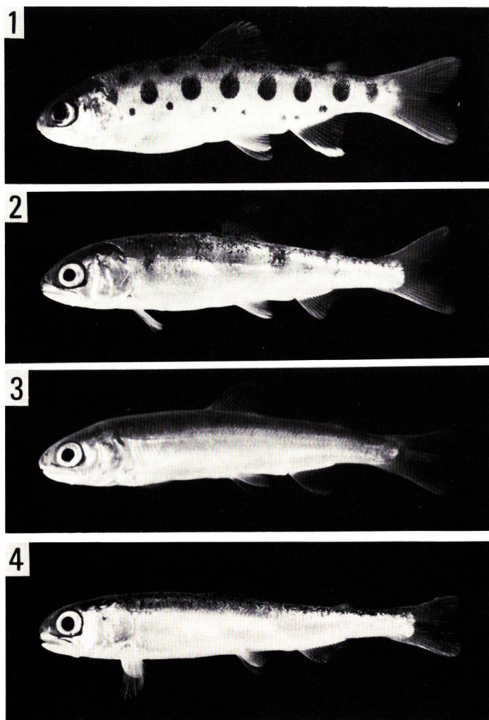
Fig. 5. Appearances in the juveniles of masu salmon (1 : FL=75 mm), pink salmon (4 : FL=79 mm) and their hybrids of N-type (2 : FL=91 mm) and B-type (3 : FL=55 mm).