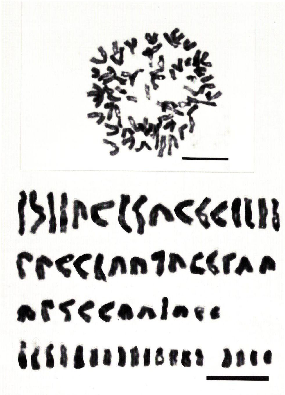
Fig. 4. A karyogram of a hybrid embryo with 59 chromosomes. Bars indicate 10 \mu m.