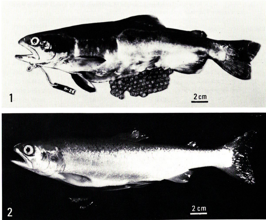
Fig. 1. External appearance of the maturing female hybrid at two years old with its ovulated eggs. The fork length is 29.9 cm.