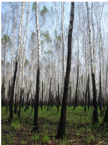
Fig.10. The scorched Betula platyphylla trees in the forest after the moderate intensity surface fire in May, 2006. The photograph is taken in June, 2006.