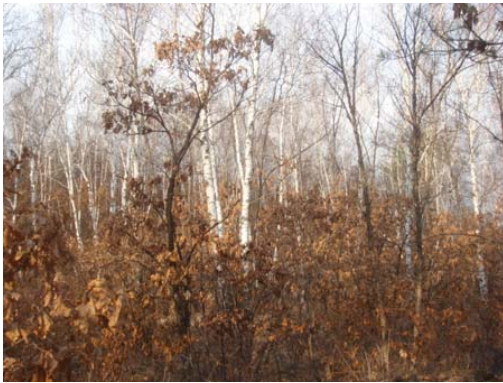
Fig.8. The sprouting and regeneration of Quercus mongorica in the forest floor of Betula platyphylla dominated matured stand. The photograph is taken in the late September, 2006.