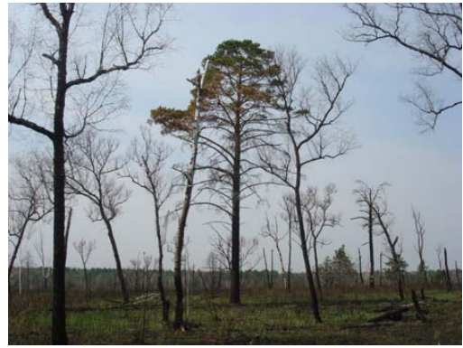
Fig.7. The survived Pinus sylvestris after the intense surface fire.