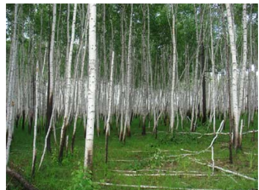
Fig.11. The scorched Betula platyphylla trees in the forest after the low intense surface fire in May, 2006. The photograph is taken in June, 2006. Even after the fire, they keep much fresh leaves.