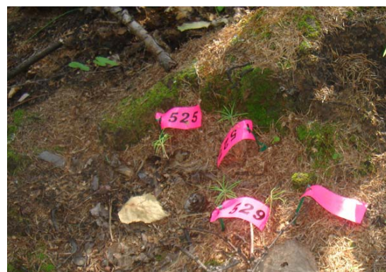
Fig.4. The regenerating Larix gmelinii seedlings on the moss in the forest floor.