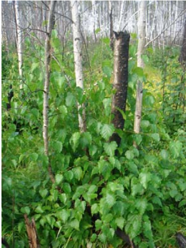
Fig.6. The sprouting from the same root after the repeated surface fires. At least the three different cohorts are included.