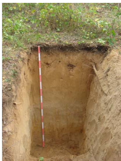
Fig.3. A typical soil profile of sandy texture in the southern part of Amur region.