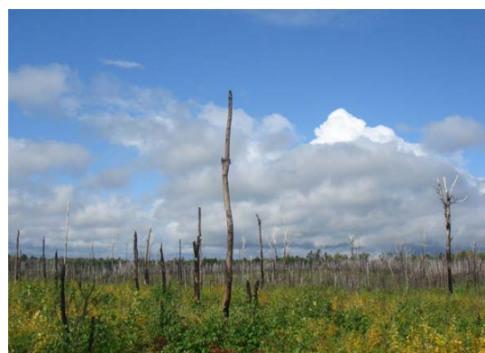
Fig.5. The Betula platyphylla forest after the stand replacing fire. The regenerating seedlings are mainly those of Betula platyphylla , Populus tremula and Alnus hirsuta .