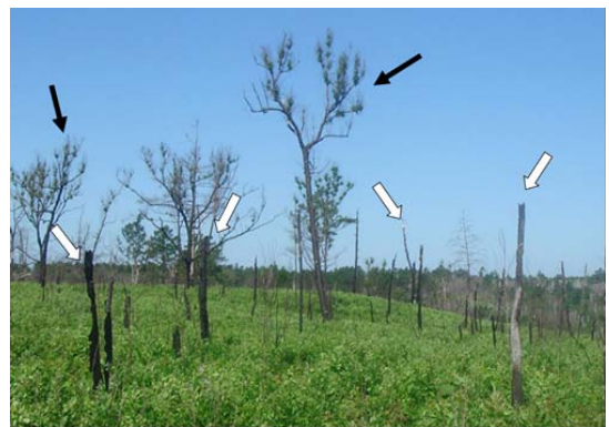
Fig.9. The survived Betula davurica after the intense fire in the mixed Betula platyphylla and Betula davurica forest. Black arrows show the survived Betula davurica and white ones show the dead Betula platyphylla respectively.