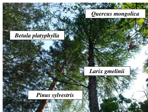
Fig.2. The canopy structure in the mixed forest with the Larix gmelinii , Pinus sylvestris , Quercus mongolica and Betula platyphylla in this region.