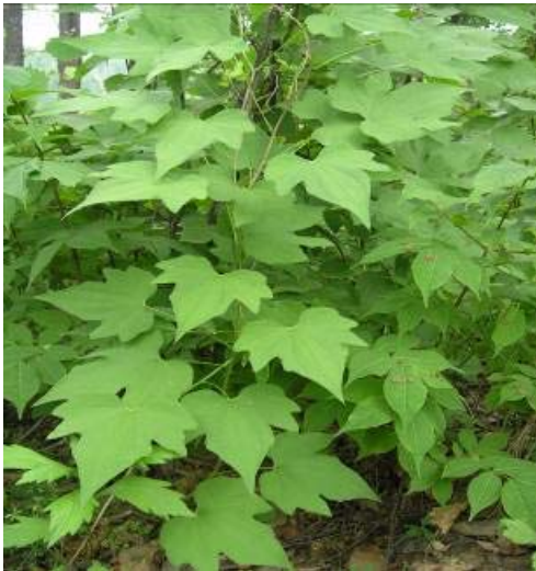
Fig. 1. Dioscorea nipponika Makino.

The largest inhabited area in Amur district is the city of Blagoveshchensk, located upon the junction of two large rivers: the Zei and the Amur (Fig. 2). Although the city and its surroundings lie in the zone of secondary vegetation, boreal vegetation has influenced the characteristics of the area's vegetation.