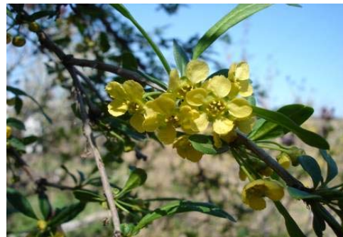
Fig. 3. Princepia chinensis (Oliv.) Oliv. ex. Bean