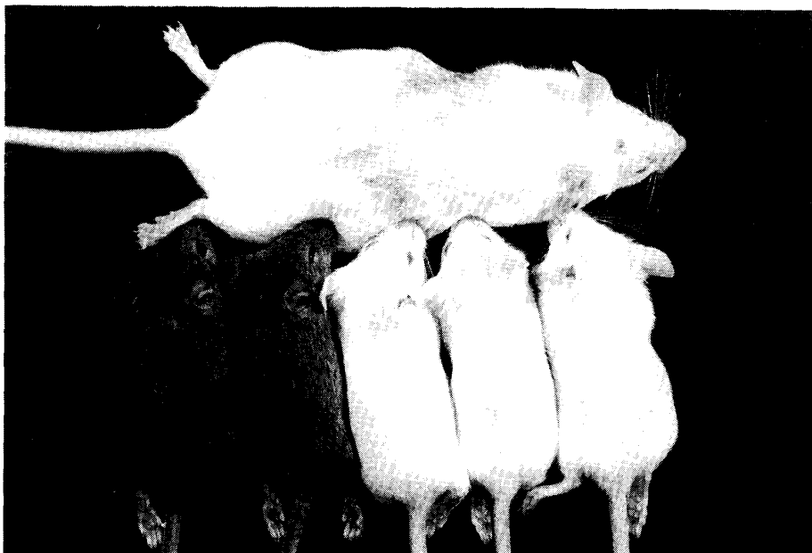
Fig. 2. The female chimeric offspring which gave both albino and agouti progeny after mating with an ICR male mouse (albino).