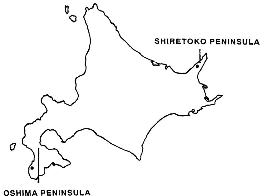
Fig. 1. • : Location of capture sites where 26 bears were caught alive (13 from the southwestern part of the Oshima peninsula and 13 from the Shiretoko peninsula).

Samples were obtained from both wild and captive animals. Figure 1 shows the location of the capture sites where a total of 26 bears were caught alive; 13 from the southwestern part of Oshima peninsula and 13 from Shiretoko peninsula. The population on Oshima peninsula is thought to be isolated from the population of central Hokkaido 10 ), and it has tended to decrease in total number recently 15 ). The population on the Shiretoko peninsula is considered to be nearly isolated from the population of central Hokkaido 3 ).