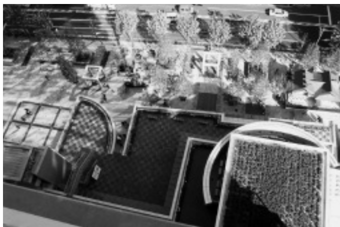
Figure 4. Tornale Nihonbashi Hamacho

Each person adds his or her input to the sound as ideas are developed through casual conversation in cordial atmosphere. Everyone expresses their own impressions of the sound and these statements lead to creation of new ideas. The ideas are carried out at immediately and modified according to the group's response. This process is continued.