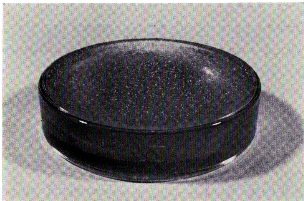
Fig. 1. Mature fruiting bodies of D. discoideum floated by pouring water onto an agar surface. Myxamoebae were harvested during the exponential phase of growth, suspended in Bonner's salt solution, diluted 100 times, and washed three or four times. The amoebae suspension was placed on an agar surface and allowed to develop until the maturation of fruiting bodies.

(BONNER, 1947) and centrifuged 3 to 4 times to remove excess bacteria. The packed cells were suspended approximately 2 \times 10^7 cells per milliliter and 0.1 ml cell suspensions were spread on 14 mM phosphate-buffered agar in flat small Petri dishes (diameter, 6 cm) and incubated at 22°. Under these conditions amoebae began to aggregate after 7–8 hr and aggregation was completed in 14–16 hr. A Petri dish containing replaced amoebae was used for electron microscopic observation, at 2 hr intervals. Distilled water was introduced carefully into the Petri dish and then the area of liquid-air interphase where floating organisms were absent was carefully scooped up onto an electron microscope mesh. Meshes were observed under a Hitachi electron microscope at 80 kV. At a late stage (10 hr or more) of the replacement culture, a membraneous structure was clearly observed (Fig. 2). This latter stage membraneous mat seems to be thicker than the earlier ones judging from the increased resistance of the mat to electron beams. At 20 hr and later stages the fibrous structure in the membraneous mat became very dense (Fig. 2, C and D).