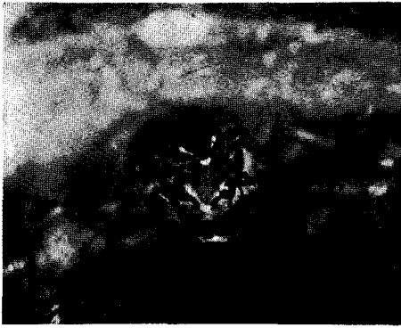
Fig. 3. Pairing of Hyla seen from front. (about natural size)

The animals congregate around the spawning place in considerable numbers in the earlier part of the night croaking noisily but by morning the majority of them have disappeared. The number of females at the breeding place is remarkably small as compared with that of the male. Observations seemed to show not more than one female to fifteen males.