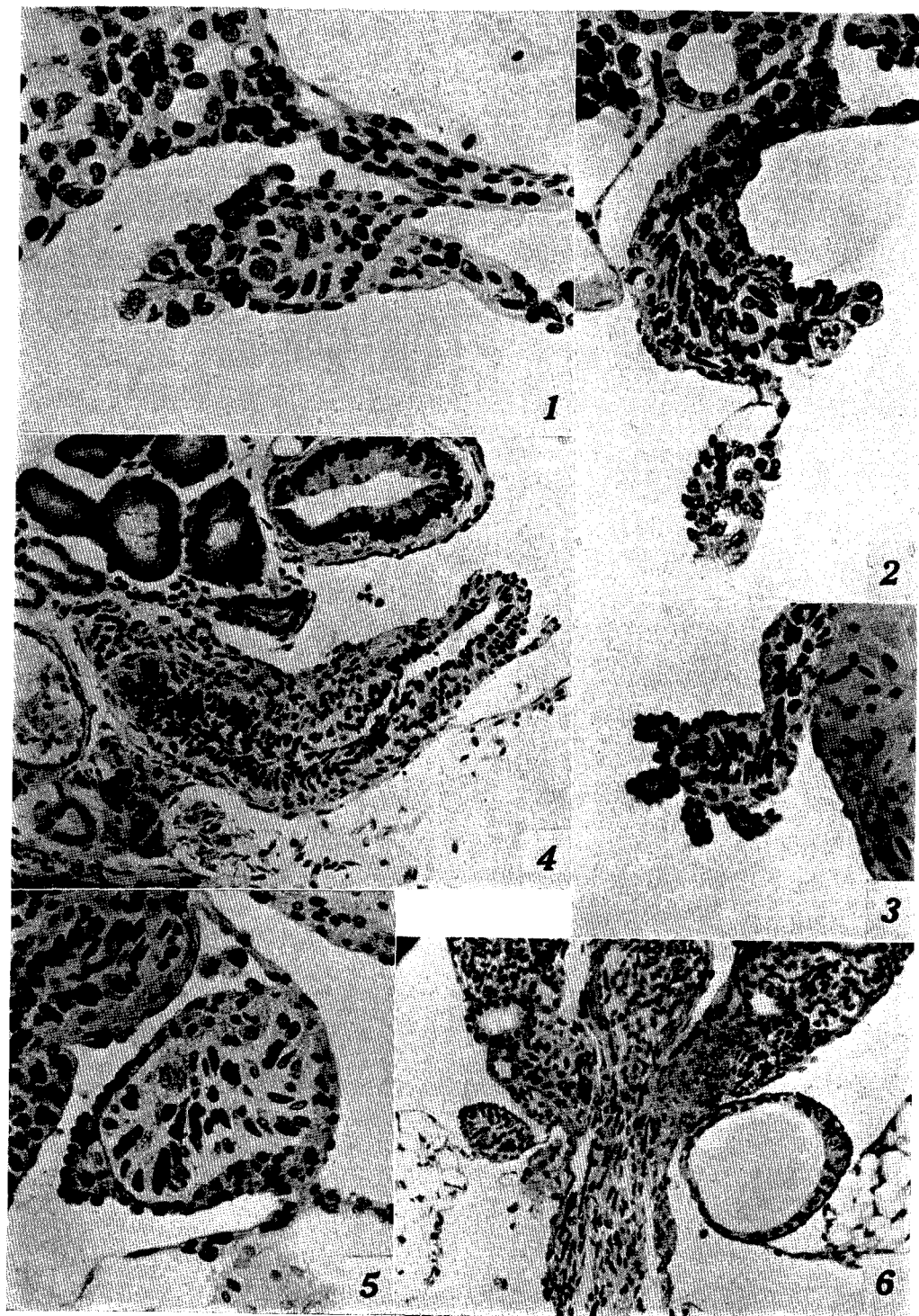
K. I. Hanaoka, The Effect of Testosterone-propionate