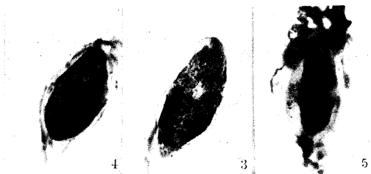
Figs. 3 and 4. Showing plasmolysis due to treatment with absolute alcohol, and staining ability of V. blue. \times 400 .