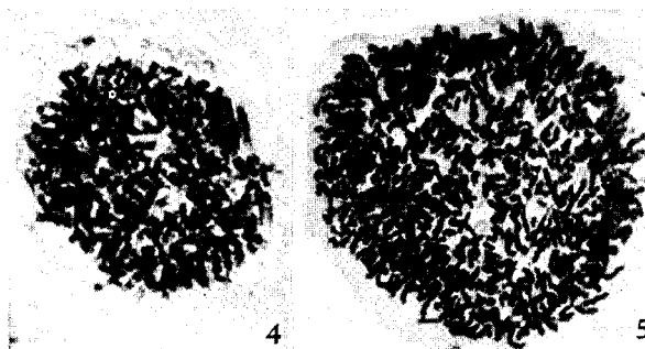
Figs. 4-5. Photomicrographs of the chromosomes from regenerating rat liver cells. 4; probably 16n cell. 5; probably 32n cell.

Beams & King (1942), Biesele (1944), Wilson & Leduc (1948, 1950a), Tanaka (1953a, 1953b) and Makino & Tanaka (1953) reported that many polyploid cells appeared in the hepatic cells during the period of liver restoration. The results of the present observations have shown that although there is a wide variation in chromosome number, the cells in the hyperploid range ( 4n to 32n ) are extremely frequent in the regenerating liver cells of rats after partial extirpation. The present author seems to be the first to report the occurrence of hyperploid cells ranging from 8n to 32n in the restoring rat liver. The occurrence of such hyperploid cells was again confirmed by the examination of DNA-content (Leuchtenberger and Schrader 1951, Naora 1951, Thomson and Frazer 1944, etc. ).