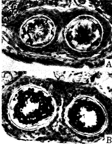
Fig. 4. A and B. Photomicrographs of cross sections of the paired "testes". In these cases the germ cells of cypris origin are to be seen in both of the paired "testes". x ca. 150.

is filled with the ripe spermatozoa (Fig. 3, C and D), whereas, so far as our observations go, nothing like this has ever been observed in the cell which constitute the "testis". In all of the mature Peltogasterella measuring 4 mm up to 8 mm in length, the cypris cells have been found either in one side or in both sides of the paired "testes" (Fig. 4). Thus, in the former case it appears that only one "testis" usually functions at a time (Fig. 3, D, E, and F). These ripe spermatozoa derived from the cypris cells are released into the mantle cavity and effect fertilization of the first batch of eggs. At that time, the residual germ cells of cypris origin have been left in the functional "testis" and the fertilization of the succeeding batches of eggs may be effected by the spermatozoa derived from them (Fig. 3, rc). On the other hand, the empty "testis" of the opposite side, having the appearance shown in Fig. 3,