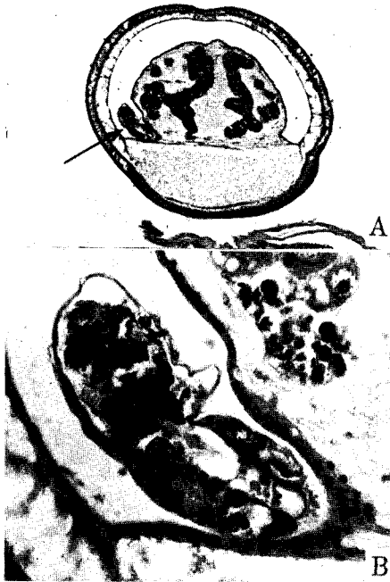
Fig. 2. A. Photomicrograph of a cross-section of immature externa. Note the cypridian cellular mass in the mantle cavity (arrow). \times 60 , about. B, A high-power view of the cypridian cellular mass. \times 400 .

The young externae described above are invariably visited by the cypris larvae of the same species. These larvae do not simply attach to the body of the