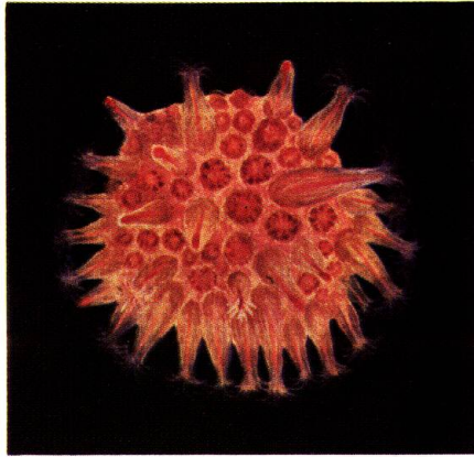
Fig. 1. Alcyonium pacificum Yamada in living color. Kuriyama del. \times 1 .