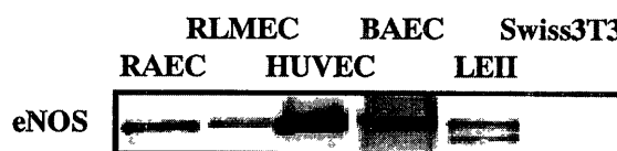
Figure 1. Western blot analysis of eNOS protein in various types of endothelial cell.

We first tested the expression of eNOS protein in HUVEC and BAEC, and compared