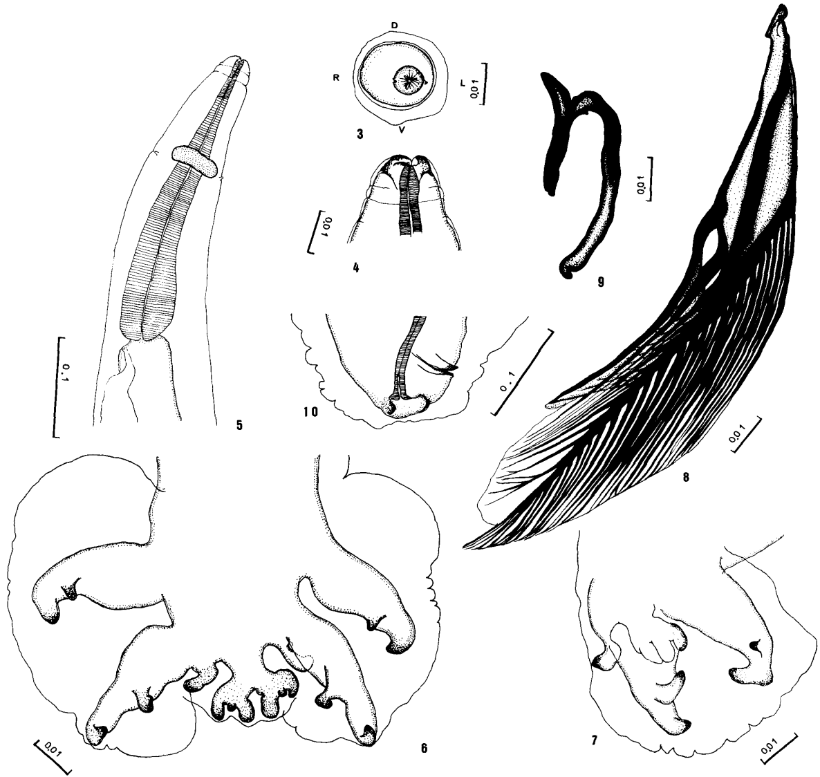
FIGURES 3-10 Viverrostrongylus brauni (LINSTOW, 1897) gen. et comb. n. (scale in mm)