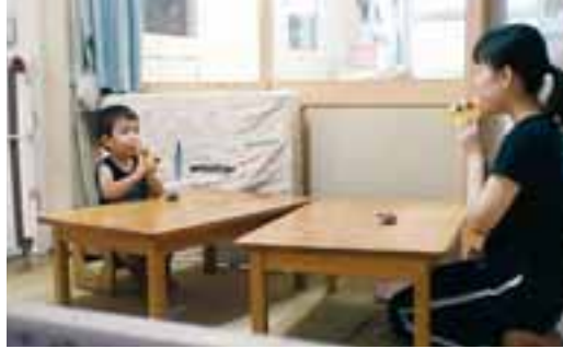
Figure 1 In the laboratory