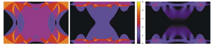
Fig. 2. Conductance of a two-cluster device (inset) as a function of the orientation of the magnetizations.