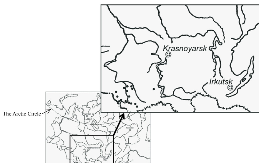
Fig. 1. The area of Myricaria bracteata in Western Siberia.

The author collected plants in the southern Siberia: in the Altay Mountains, Tyva, Pribaikalye and Zabaikalye during expeditions from 1990 to 2006. Also we collected seeds and cuttings of species of Myricaria and grew up them in the nursery of the Laboratory of Dendrology, SB CSBG RAS.