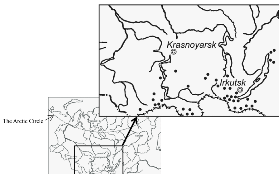
Fig. 2. The area of Myricaria longifolia in Central and Eastern Siberia.