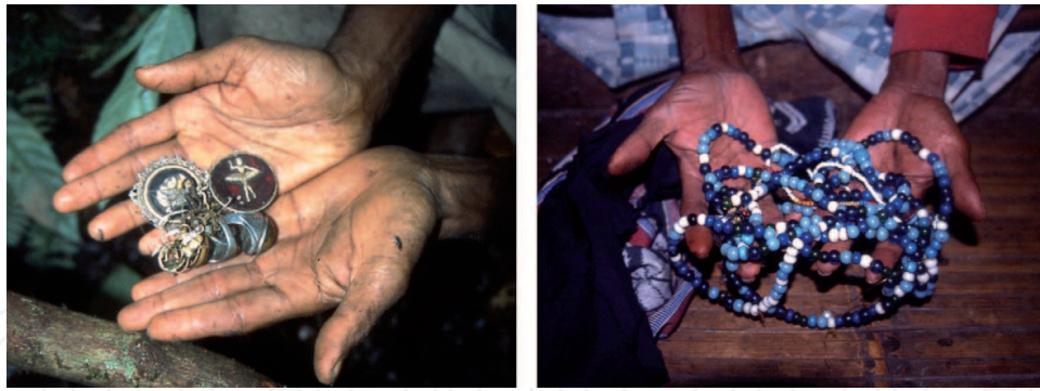
Figure 5. Offerings to sira tana and awa .

believe that if a trapper intones the names when offering or setting traps, he or she succeeds in trapping. On the other hand, there are evil natural spirits such as the awa kina , who try to make hunters fall from trees or get injured by machetes. Then there is the evil sira tana that makes villagers get lost in the forest. A forest where a villager once disappeared or a villager lost his/her way is considered as a place in which evil natural spirits have been dwelling. These forests have not been used for a long time by the imposition of seli kaitahu .