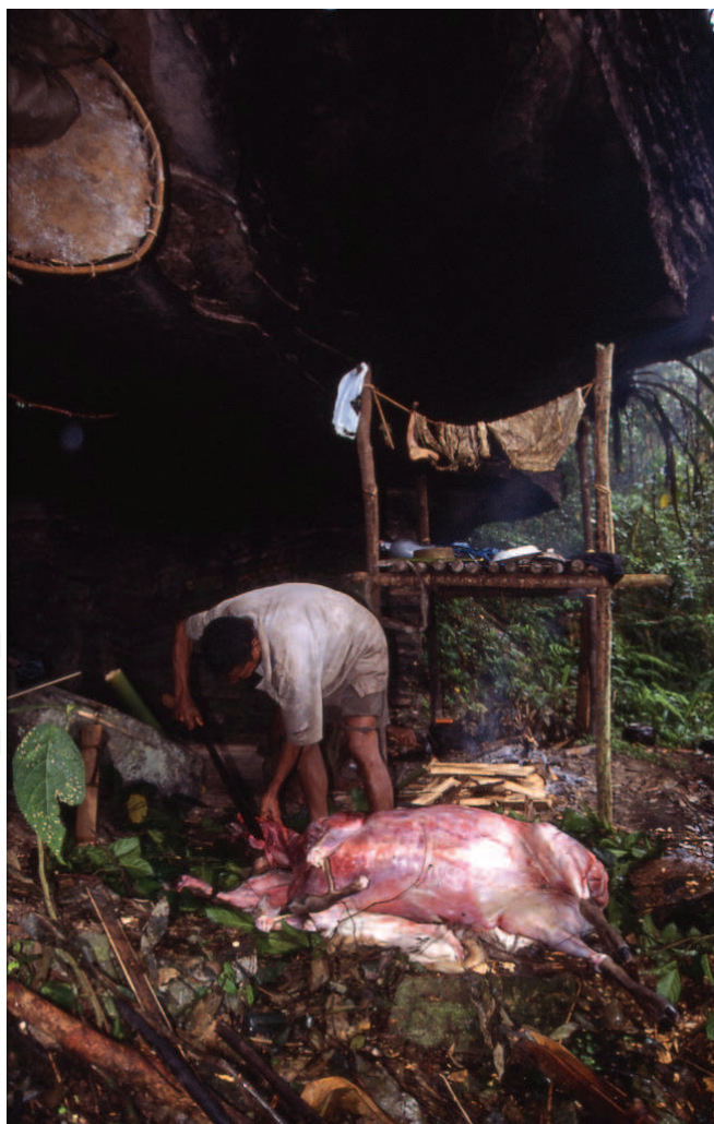
Figure 4. A man who cuts a Timor deer at his liakika .

Some of the awa or sira tana are good spirits ( alowa oho ), while others are evil ( alowa kina ). Natural spirits who inform the villagers of their names in their dreams are good. The villagers