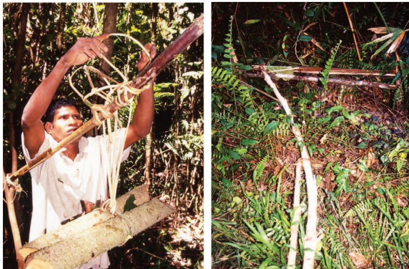
Figure 3. Left: a weighted noose trap, sohe . Right: a spear trap, hus pana .