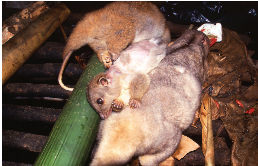
Figure 2. Cuscus ( Phalanger orientalis ).