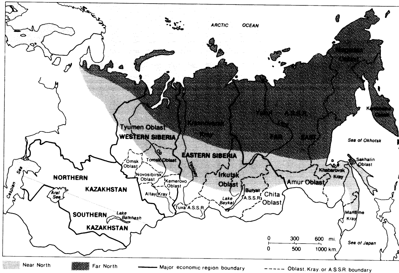
Fig. 1 Siberia's Northland

Sources : L. Dienes. "The Development of Siberian Regions : Economic Profiles, Income Flows and Strategies for Growth." Soviet Geography : Review and Translation Vol. 23. No. 4 (April. 1984)